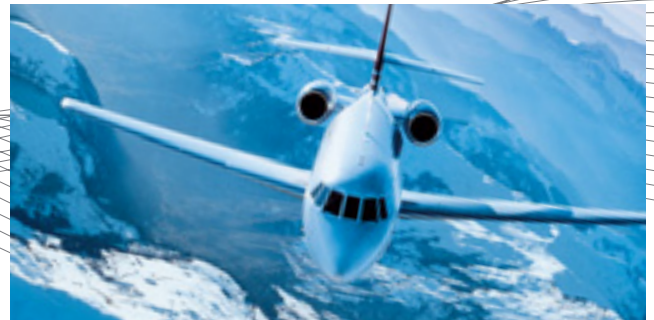
*Available April 2008