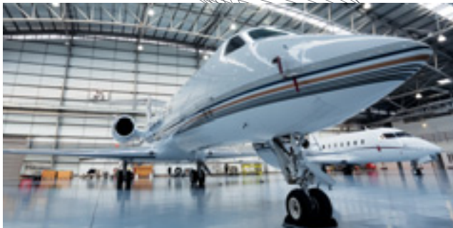
Maintenance performance: a cornerstone of TAG Aviation technical services.